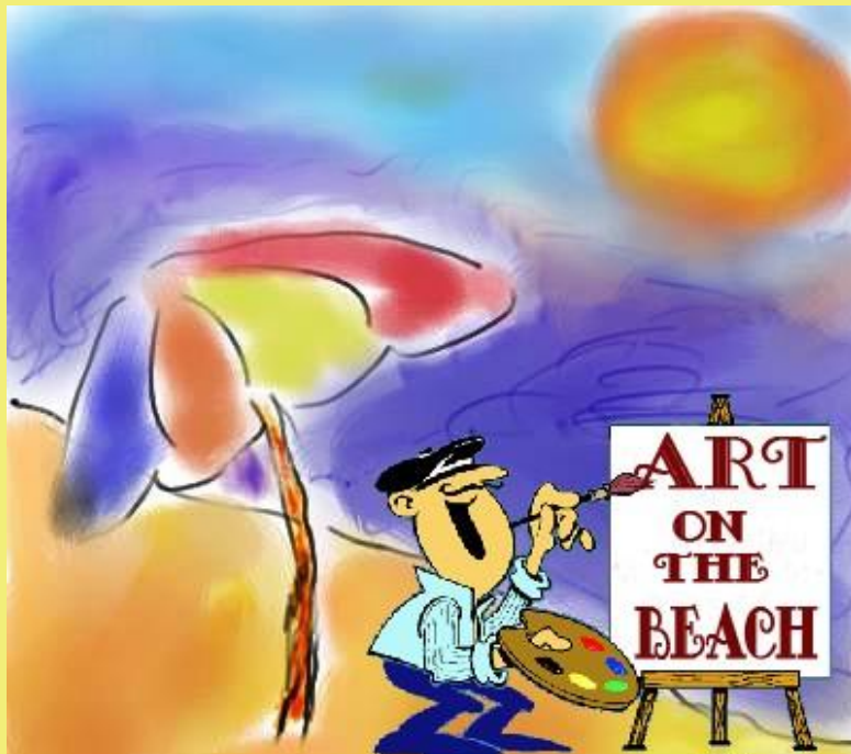
Art on the Beach 2020 is ON